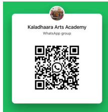
Scan QR code to join Kaladhaara whatsapp group