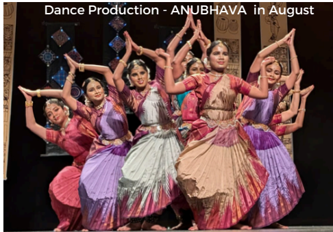
Dance Production - ANUBHAV in August

This Quarterly newsletter brings you the latest happenings from our school. From student achievements and upcoming events to insightful articles and highlights from recent performances, our newsletter serves as a platform to celebrate the journey of our talented students/artists. If you would you like to see a topic on the newsletter, please send your ideas to kaladhaaravideos@gmail.com